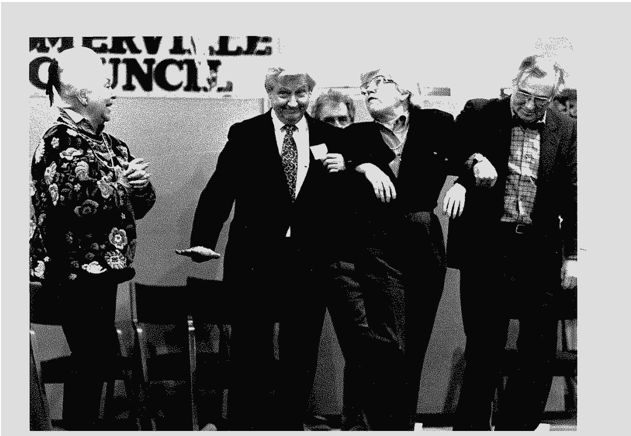
The Next Generation

Bill White: And how many different actors have been involved over these years with you?