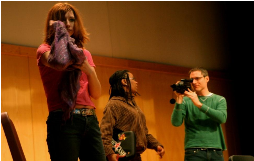
A scene from Running On E