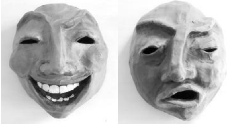
"Two of six masks that represent the merry-go-round of addiction"

remind them that you don’t have to be an addict to have a really devastating life change because of drinking too much or taking drugs.